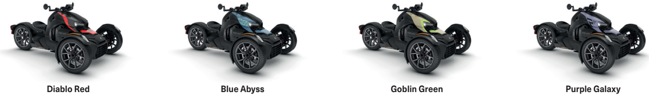
Diablo Red Blue Abyss Goblin Green Purple Galaxy