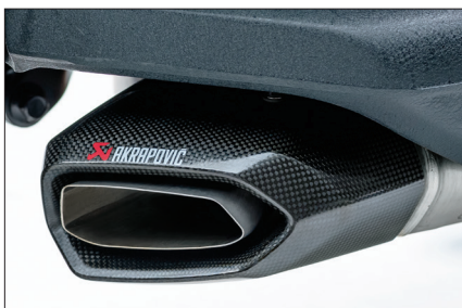
AKRAPOVIČ EXHAUST Unique sound signature and high-end exhaust.