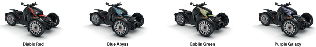
Diablo Red Blue Abyss Goblin Green Purple Galaxy