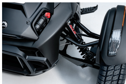
FULL KYB HPG SHOCKS Front and rear KYB HPG shocks with remote adjusters and 1 inch of extra suspension travel to optimize your ride and improve comfort.