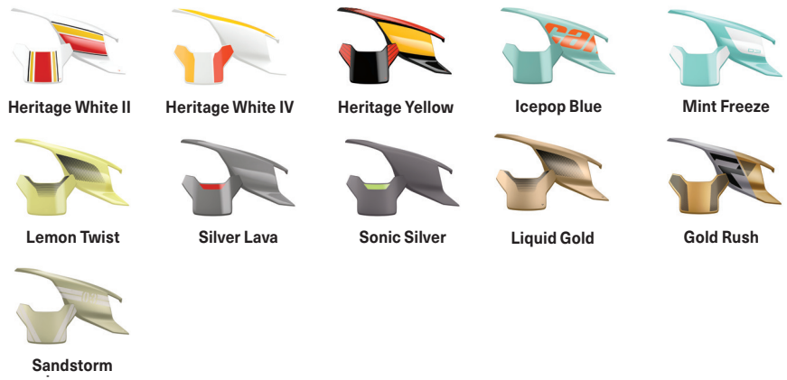
Heritage White II Heritage White IV Heritage Yellow Icepop Blue Mint Freeze Lemon Twist Silver Lava Sonic Silver Liquid Gold Gold Rush Sandstorm