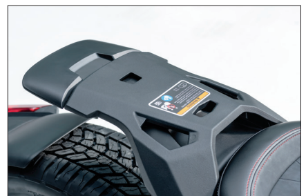
MAX MOUNT STRUCTURE Makes the unit 1+1 ready. It also increases the carrying capacity for different storage options.