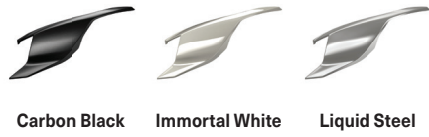
Carbon Black Immortal White Liquid Steel