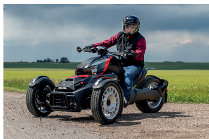
UNIQUE RALLY EXPERIENCE A vehicle designed for all-road trips with hand guards, rally comfort seat for a more reactive rider position and adjustable large anti-slip foot pegs.