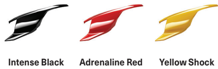
Intense Black Adrenaline Red Yellow Shock