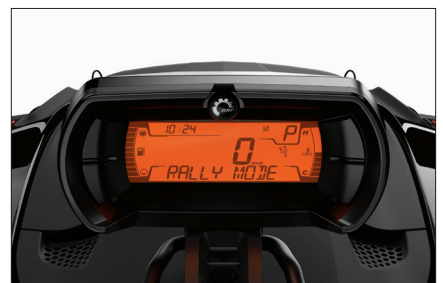
RALLY MODE AND TIRES Allows you to have more flexibility and fun off-pavement by optimizing VSS input and enabling you to perform controlled drifts with adapted all-road tires.

©2023 Bombardier Recreational Products Inc. (BRP). All rights reserved. ®, TM and the BRP logo are trademarks of BRP or its affiliates. 1 All other trademarks are the property of their respective owners. See your authorized BRP dealer for details and visit canamonroad.com . 2 Choice of one set of Classic Panels included upon vehicle purchase. 3 Exclusive Panel Kits are available in limited quantities.