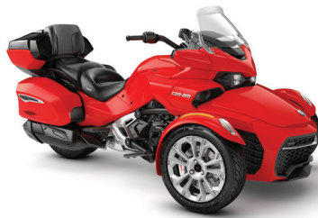
■ PLASMA RED PLATINUM*