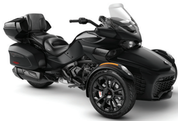
■ MONOLITH BLACK SATIN DARK*