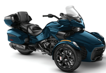
■ PETROL METALLIC DARK*